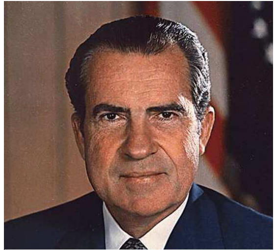
Figure 2 - Richard Nixon. Retrieved March 24, 2009, from http://www.visitingdc.com/president/richard-nixon-picture.htm

In 1968 his party, the Republicans, nominated him again for presidency. In that year he won the presidential elections from Democrat Hubert Humphrey. It was a close race; although Nixon earned the most electoral votes (301 against 191 for Humphrey) he outreached Humphrey only by half a million votes in the United States. 63