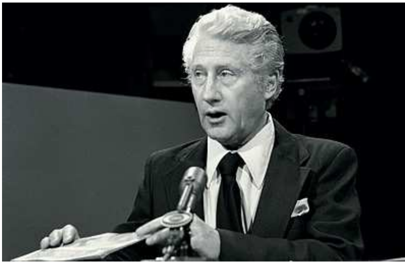
Figure 5 - Mark Felt (Deep Throat) 79

Bob Woodward had close connections to a hidden source at the Federal Bureau of Investigation (FBI). The source hid under the name Deep Throat . Nobody knew who the hidden source was until the summer of 2005, when Mark Felt, depicted in figure 5, revealed in Vanity Fair 75 that he is Deep Throat. The Washington Post confirmed the story. 76 In 1972 Felt was the second ranked official at the FBI. He had an arrangement with Woodward that his identity would not be revealed. He and the reporter met each other mostly in underground parking garages. 77 Deep Throat was important for the reports about Watergate. But he was never quoted in the newspaper. The information from him was only to confirm information or to add some perspective to the findings of the two reporters. 78